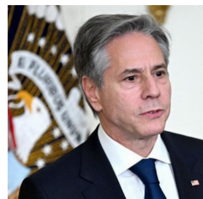
Antony Blinken US Secretary of State

The overall outlook of the US has deteriorated considerably in the middle of high inflation. The US covers over 30% of the world’s economy with a largely significant consumer base. So, even China would use America’s consumers for leverage. Recently, the US has been losing hold of Asian trade, as China has been campaigning to regionalise supply chains. However, it has also performed better than all other G7 countries, with a real GDP just 1.4% below trend.