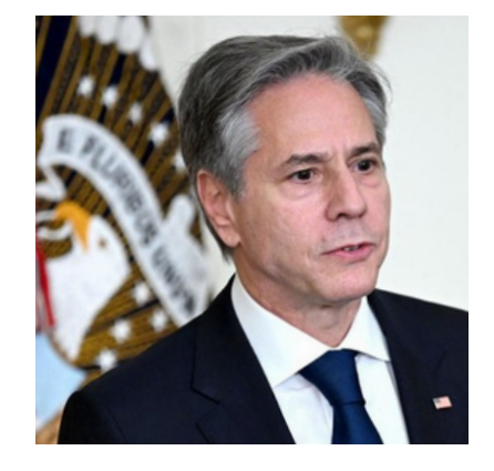
Antony Blinken US Secretary of State

Currently, China's growing economy is an important source of global demand. Though it may decrease the demand for commodities, it will create many new opportunities including manufacturing exporters. Whilst the country is currently facing an economic recovery, typical safety nets (retail sales, industrial production and fixed asset investments), grew slower than anticipated, also causing an increase in youth unemployment. The current lack of development has forced aggressive monetary methods.